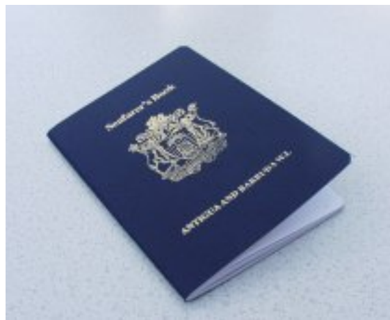
Picture 1 Cover

With effect from 01 July 2001 Seafarer's Books issued by this Administration will get a new layout according to pictures 1 -4.