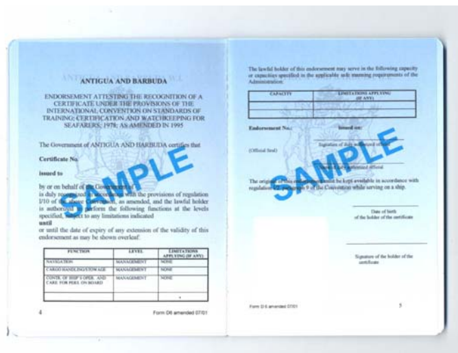
Picture 4 Pages 4 - 5

Page 3 of the Seafarer's Book as well as the endorsement(s), if applied for, will be protected by a transparent film. The transparent film covers the stamp and the signature of the issuing officer. The bearer has to sign the documents on the top side of the film.